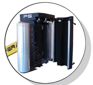
Quick & Easy Film Loading