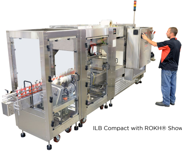
ILB Compact with ROKH® Shown